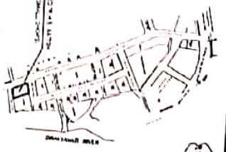
KEY PLAN (SECTOR - 14E)